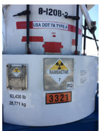
Type B downgrade to Type A

If downgrading to a Type A package, they also ask the shipper to ensure all DOT 49 CFR requirements are met for a Type A package. This would include markings: "USA DOT 7A Type A" (178.350), and "Shipper's (person certifying the package) Name & Address" (178.350 & 178.3). They also ask the shipper to have documentation showing how the package meets all the Type A packaging and package requirements outlined throughout 49 CFR