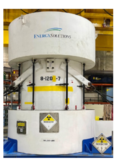
Type B downgrade to General Design

(172.101, 173.24, 173.24b, 173.403, 173.410, 173.412, 173.415, 173.461(a), 173.465, 173.474, 173.475, 178.3 &178.350).